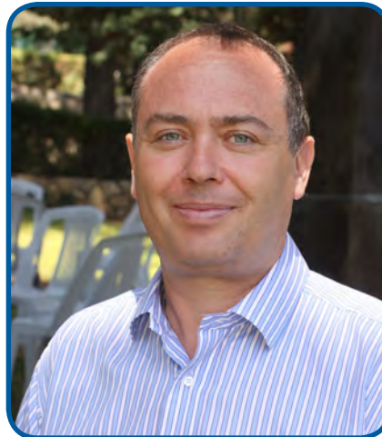
(See Pg.12 for more info.)